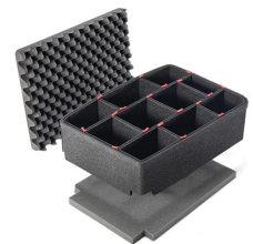
1510TPKIT TrekPak Case Divider Kit