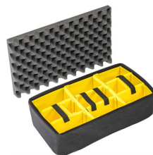
1515 Padded Divider Set