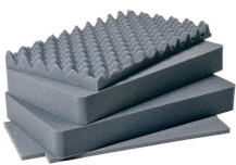
1511 4 pc. Replacement Foam Set