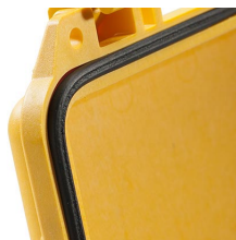
1513 Replacement O-ring