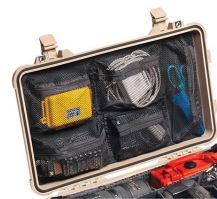
1510 Lid Organizer